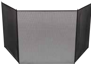
PORTABLE SAFETY SCREEN allows you to have peace of mind

Accessories that fit your home and lifestyle.