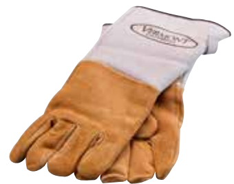
VERMONT CASTINGS LEATHER GLOVES