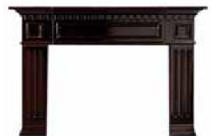
Customize your look with one of five surrounds