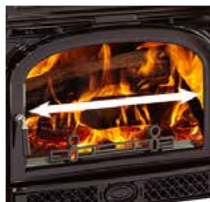
Conveniently burn up to 18" logs