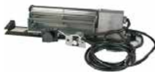
Variable speed fan to better distribute heat throughout your space