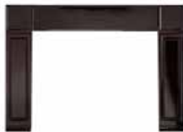
MEAD 41-11/16" x 28-1/4"