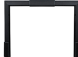
CAPRICE 35" x 25"