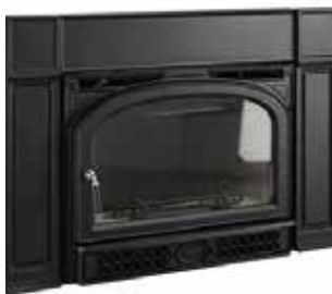
Timeless cast iron styling with a furniture-quality finish