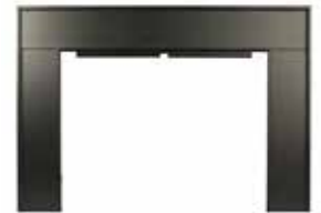
STEEL 38-1/4" x 27" (Sml), 41" x 28-1/4" (Lrg)