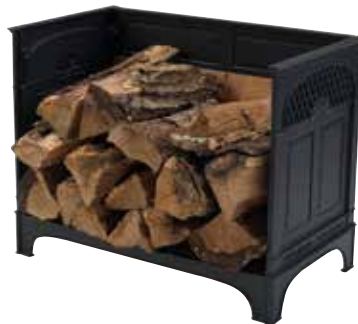
CAST IRON WOOD BIN