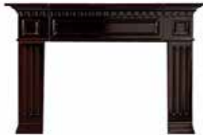
GEORGIAN 41" x 30-1/4"