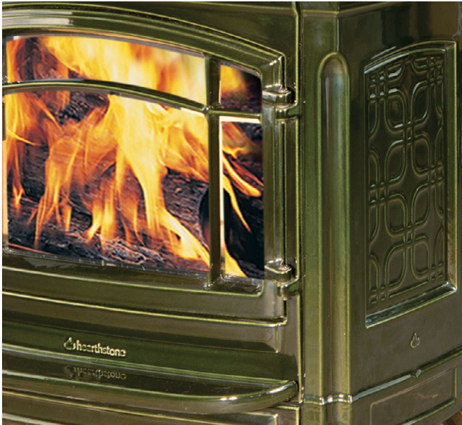
Shelburne featured with Basil Majolica Enamel finish.