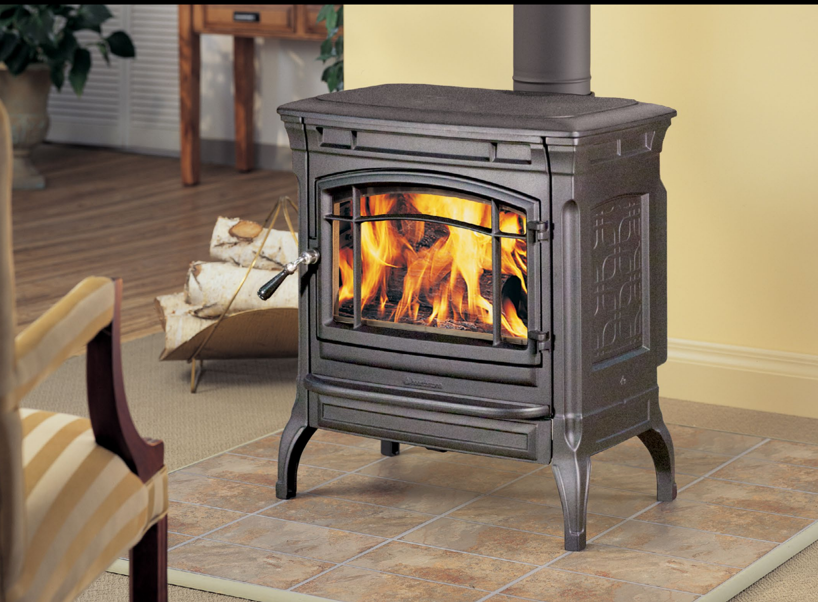
Shelburne featured in Matte Black.