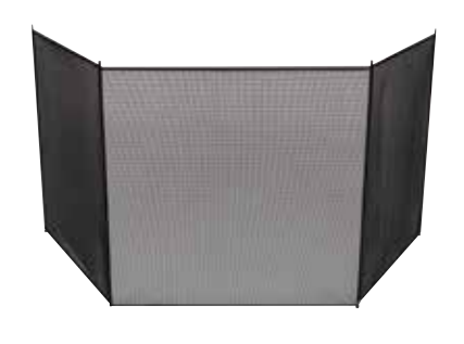
PORTABLE SAFETY SCREEN allows you to have peace of mind

Accessories that fit your home and lifestyle.