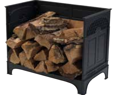
CAST IRON WOOD BIN