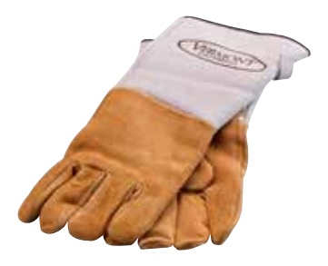
VERMONT CASTINGS LEATHER GLOVES