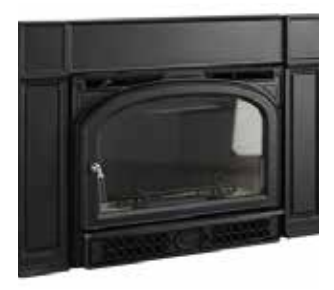
Timeless cast iron styling with a furniture-quality finish