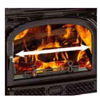
Conveniently burn up to 18" logs